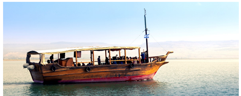
Sea of Galilee - Tiberias

Depart from Haifa this morning and ascend Mt. Tabor, to visit the church of the Transfiguration. Continue on to Nazareth, the boyhood home of Jesus. Here you will visit the Church of the Annunciation, St. Joseph's Church, and Mary's Well all located within the winding streets of the old city. Drive to Cana, site of Jesus' first miracle of turning water into wine before continuing to the Sea of Galilee to spend the night. (B,D)