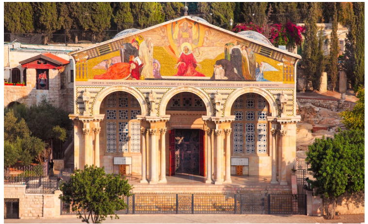
Church of All Nations

Drive to Bethlehem and visit the Church of the Nativity. See the manger where Jesus was born. Time to shop for wood carvings. Proceed to Bethany to visit Lazarus' Tomb and the village of Mary and Martha. Afterwards, return to Jerusalem and drive to the top of the Mount of Olives for a panoramic view of Jerusalem. Descend the Mt. of Olives to the Garden of Gethsemane and walk among the ancient olive trees, viewing the Kidron Valley. Visit the Church of All Nations on the Rock of Agony. (B,D)