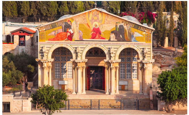
Church of All Nations

Drive to Bethlehem and visit the Church of the Nativity. See the manger where Jesus was born. Time to shop for wood carvings. Proceed to Bethany to visit Lazarus' Tomb and the village of Mary and Martha. Afterwards, return to Jerusalem and drive to the top of the Mount of Olives for a panoramic view of Jerusalem. Descend the Mt. of Olives to the Garden of Gethsemane and walk among the ancient olive trees, viewing the Kidron Valley. Visit the Church of All Nations on the Rock of Agony. (B,D)